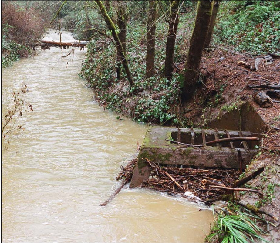
Flow capacity issues at concrete trash rack