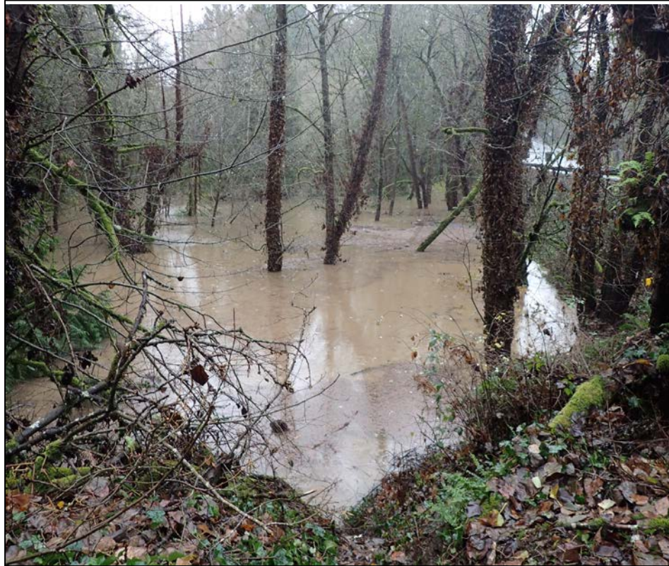
December 7, 2015 flooding conditions