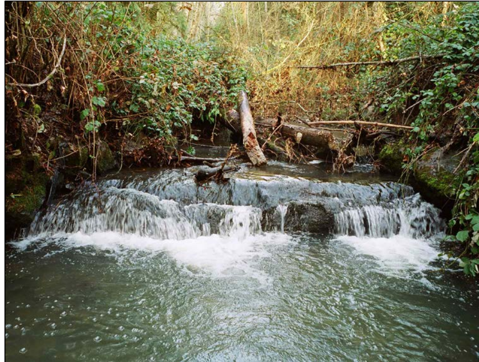
Sanitary sewer crossing in Tryon Creek