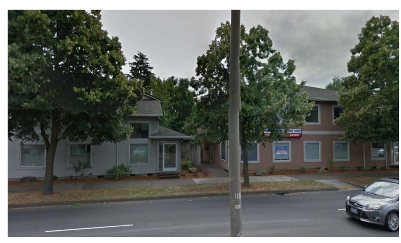
2 story building at SE 58th.