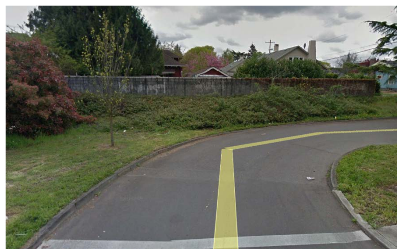
South side of Powell block wall at