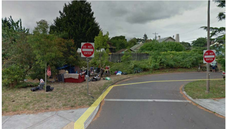
South side of Powell block wall at