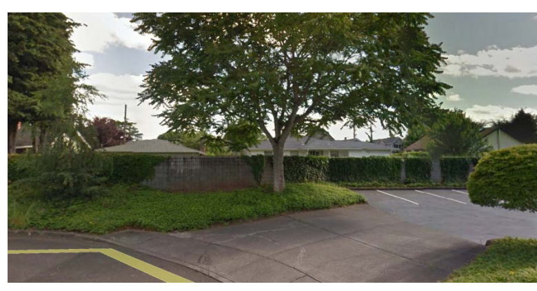
South side of Powell concrete wall