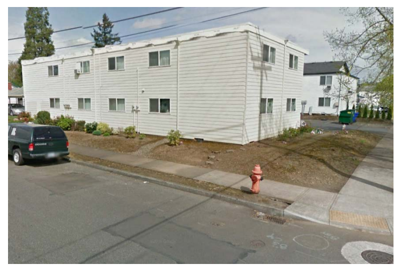
Multi-family at SE 67th.