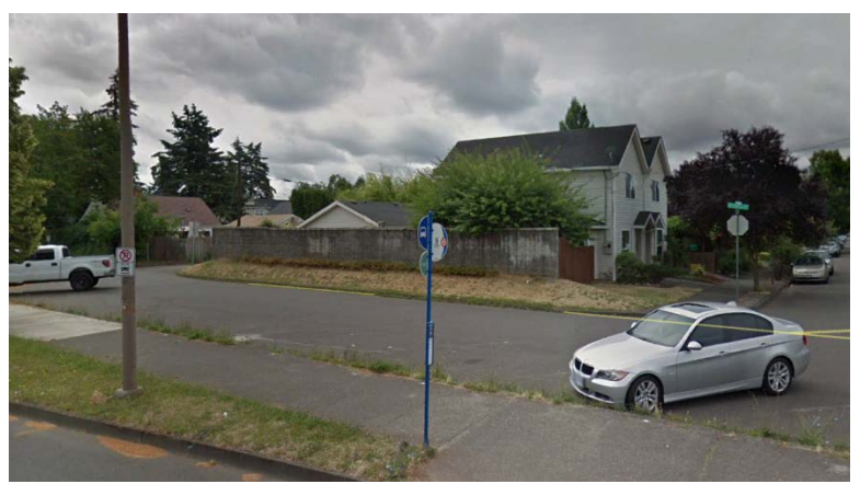
at SE 67th.