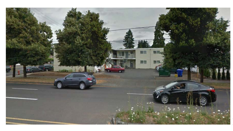
Multi-family at SE 68th.