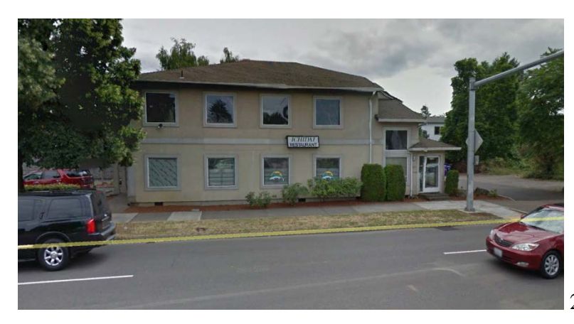
2 story building at SE 57th.