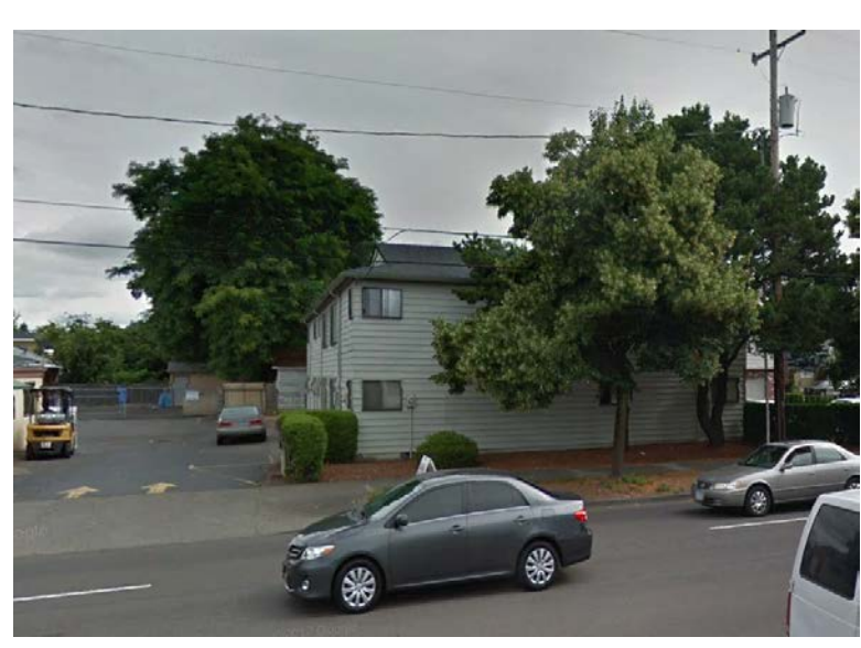
2 story multi-family at SE 66th.