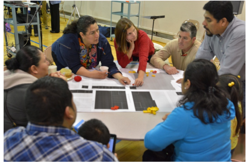
Non-Prosper Portland Financial Support