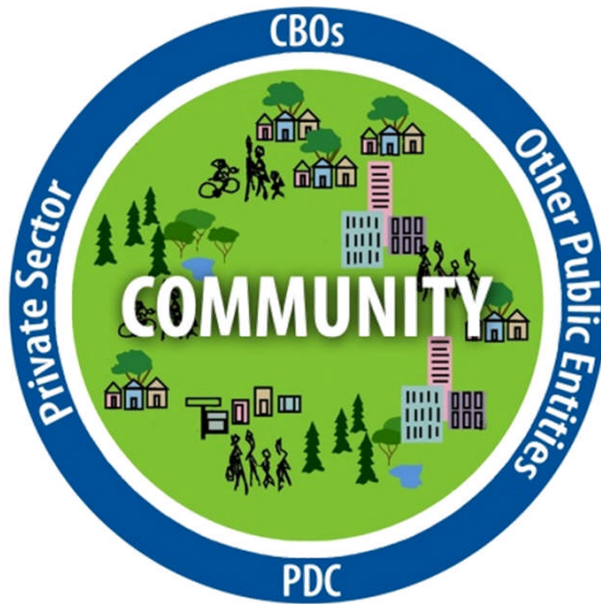
Neighborhood Economic Development