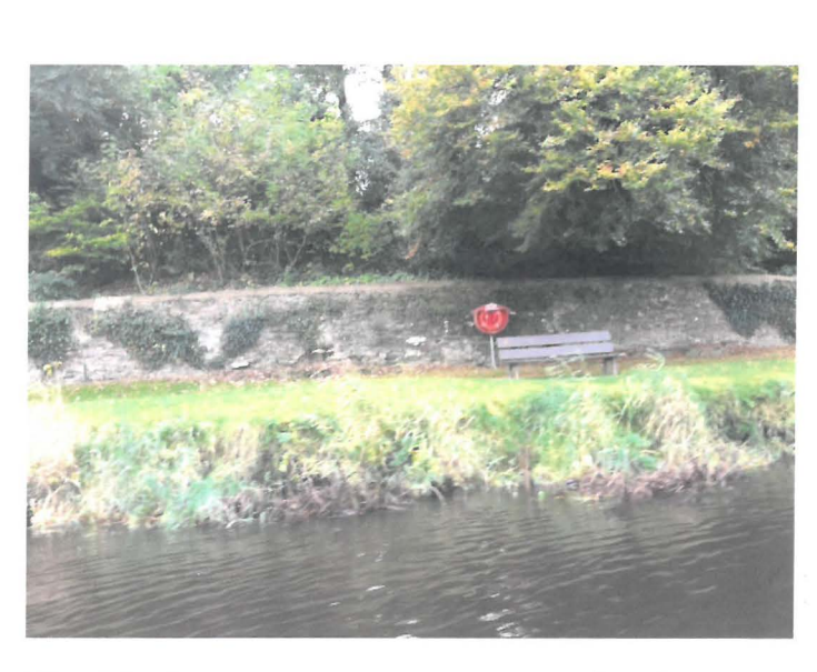
The Blackwater River, Fermoy, Ireland 2016.