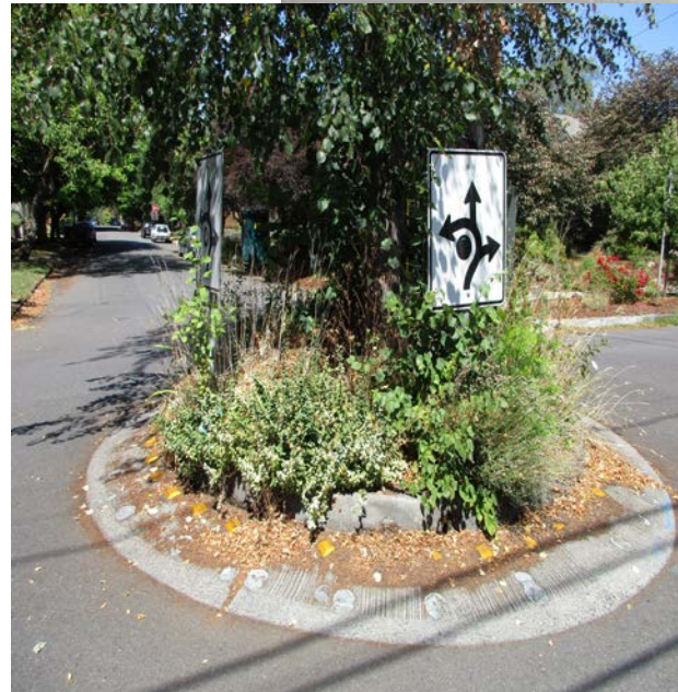
SE 45 th & Clinton Roundabout