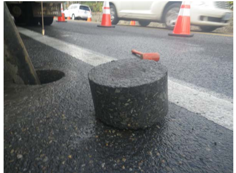
Water main pothole SE 38 th & Rhine