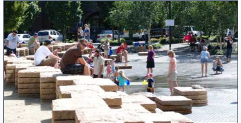
Families at Jamison Square – Pearl District