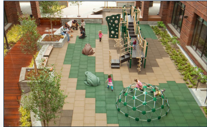
Ramona Apartments – Pearl District