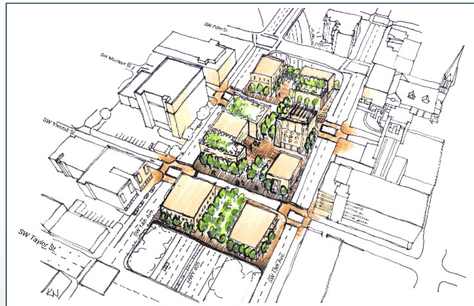
Freeway Capping Concept at Morrison and Yamhill

Policy 2.9 Reconnecting neighborhoods across infrastructure. Develop and implement strategies to lessen the impact of freeways and other transportation systems on neighborhood continuity including capping, burying or developing other innovative approaches. (Reference No. P2)