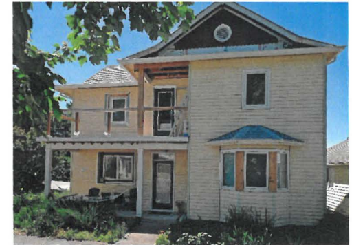
House #1 NE 71 st Ave.