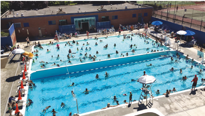
GRANT POOL AFTER COMPLETION OF CONSTRUCTION