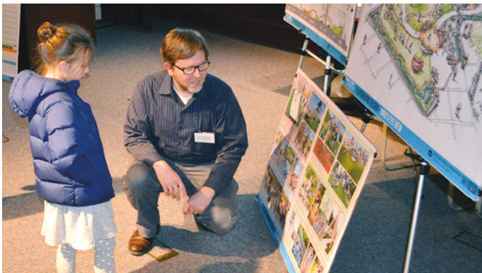
COUCH PARK OPEN HOUSE

This committee has not been charged with evaluating the efforts of PP&R to be transparent with the community. The language of the bond states that “A five-member oversight committee will review expenditures, provide annual reports.” However, the committee is particularly interested in matters of equity and transparency and has therefore chosen to review and advise PP&R’s performance in this category.