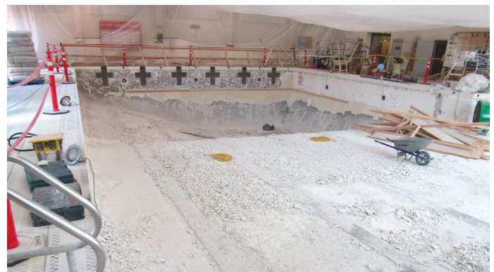
MATT DISHMAN POOL DURING CONSTRUCTION

RECOMMENDATION Establish a program-wide contingency fund.