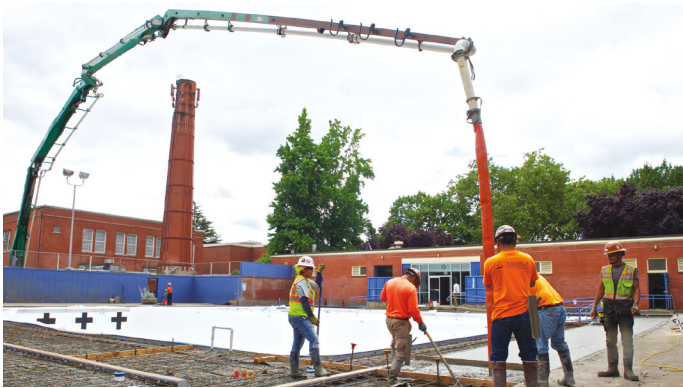
GRANT POOL DURING CONSTRUCTION

Definition: Act in a way that promotes equity, participation, accountability, and engenders trust.