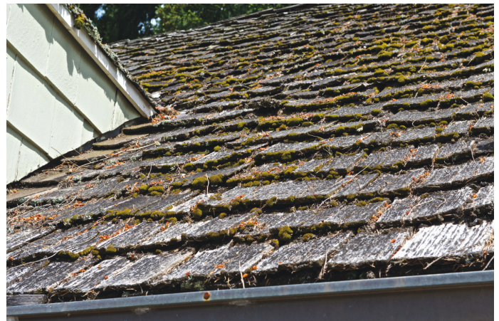
SELLWOOD POOL'S BATHHOUSE ROOF TO BE REPLACED