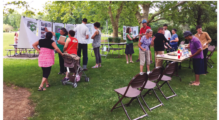
VENTURA PARK OPEN HOUSE

PP&R is projecting that this trend will continue. At this point, the bidding climate has not been detrimental. However, if the trend continues, there will likely be impacts on the cost and schedule for each project. For this reason, the committee unanimously recommends establishing a program-wide contingency fund. This fund would ensure that PP&R has the resources and flexibility to ensure that the projects delivered fulfill the promises of the bond.