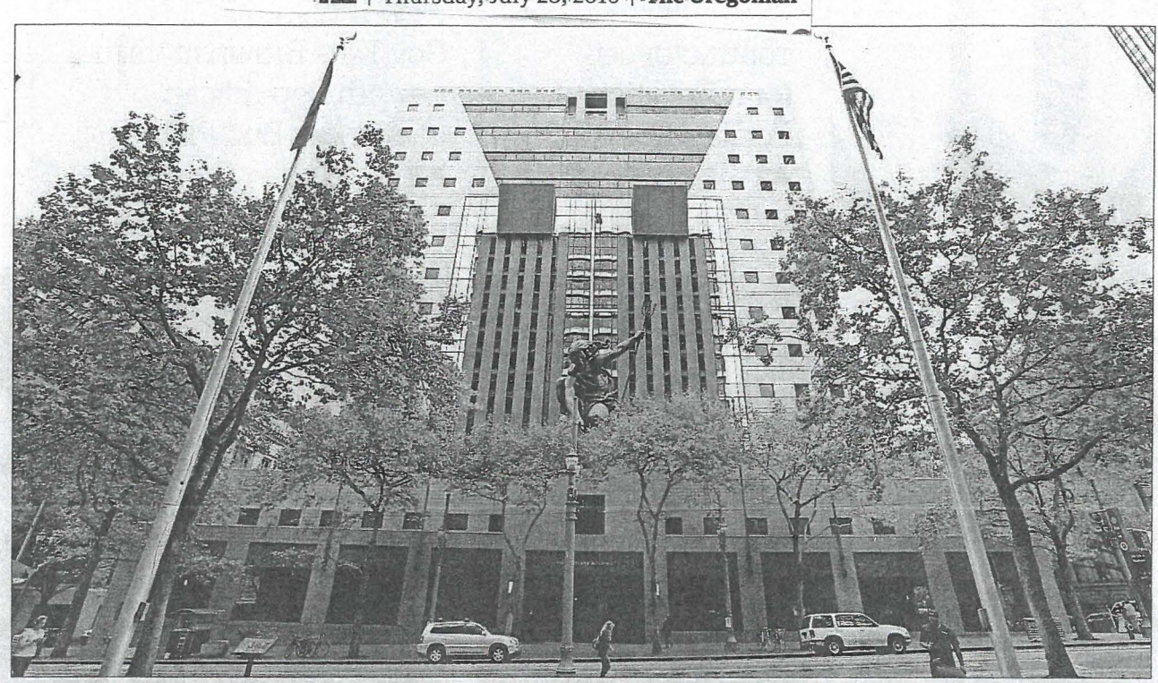
The City Council on Wednesday approved a contractor and architectural firm for a five-year overhaul of the Portland Building, The 33-year-old administrative headquarters' full-scale renovation could cost nearly $200 million.