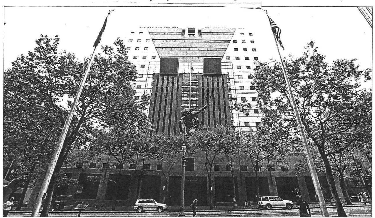
The City Council on Wednesday approved a contractor and architectural firm for a five-year overhaul of the Portland Building. The 33-year-old administrative headquarters' full-scale renovation could cost nearly $200 million.