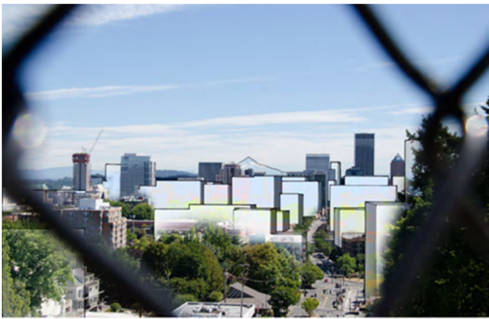
Figure 16: View of Central City and Mt Hood from SW15 - Proposed Bonus Heights

The current views to Mt. Hood from the Vista Bridge are being threatened by the heights proposed in this draft (above). Page 79 states: "The bottom elevation of the view corridor is set based on the height of existing buildings, rather than 1,000 ft below the timberline...With the recommended building heights the view of Mt Hood will remain as it is today..." This statement is untrue as can be seen in the pictures above and below. The view of Mt. Hood will change dramatically so that only the snowcap will be seen--where 1000' below the timberline can be seen today. It is the contrast between timberline and snowcap that creates this dramatic view.