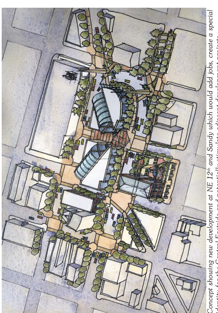
identity for the Central Eastside and potentially stimulate adjacent development projects.