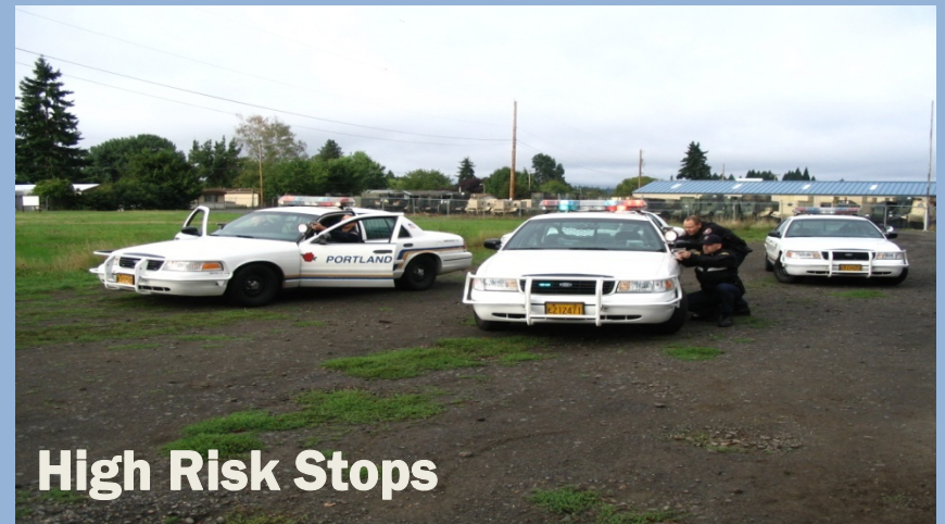
High Risk Stops