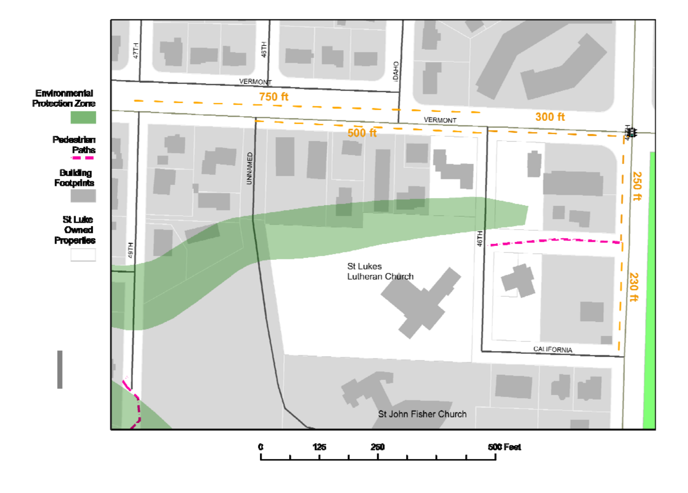
Exhibit 2 Site Map and Connections