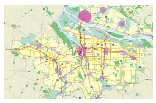
The 2040 Growth Concept - the region's adopted growth management strategy

Metro's Making the Greatest Place initiative resulted in a set of policies and investment decisions adopted in the fall of 2009 and throughout 2010. These policies and investments focused on six desired outcomes for a successful region, endorsed by the Metro Council and Metro Policy Advisory Committee in 2008: vibrant communities, economic prosperity, safe and reliable transportation, environmental leadership, clean air and water, and equity. Making the Greatest Place included the adoption of the 2035 Regional Transportation Plan and the designation of urban and rural reserves. Together these policies and actions provide the foundation for better integrating land use decisions with transportation investments to create prosperous and sustainable communities and to meet state climate goals.