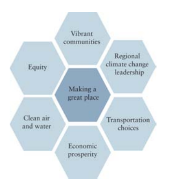
The region's six desired outcomes