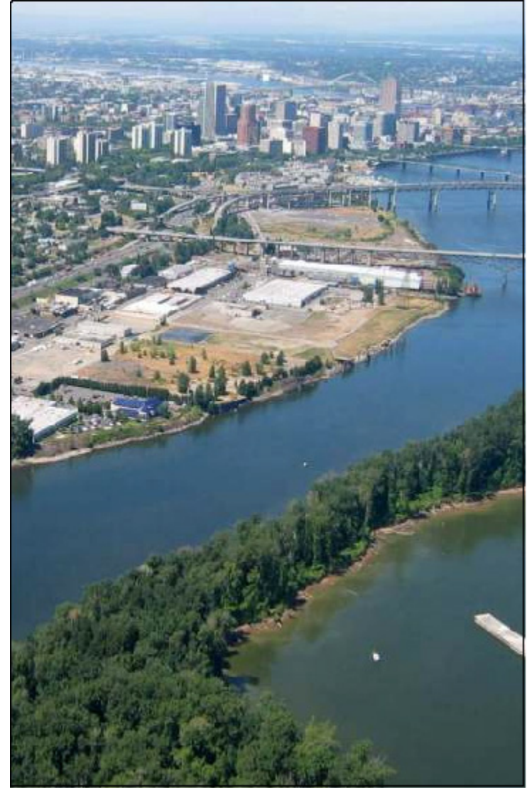
South Waterfront Greenway