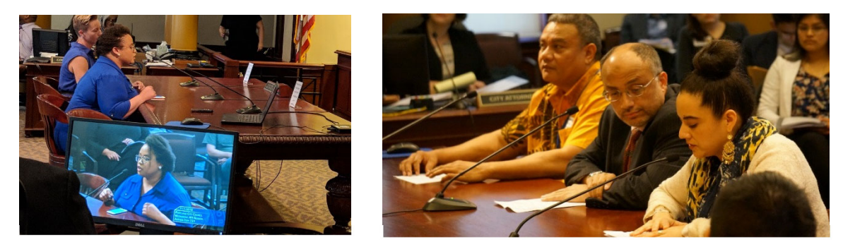
Accessibility Description: Two images of community and advisory bodies member speaking in microphones in City Council Chambers, testifying before City Council.

An important outcome of implementation is that the City collects robust data on a citywide scale for the first time. Standard uniform applications, bylaws, and regular reports by staff liaisons allow for consistent data analysis. By collecting data in one place securely and confidentially, the city will soon have a baseline to aggregate volunteer trends, identify areas for improvement, and standardize processes to reduce administrative costs.