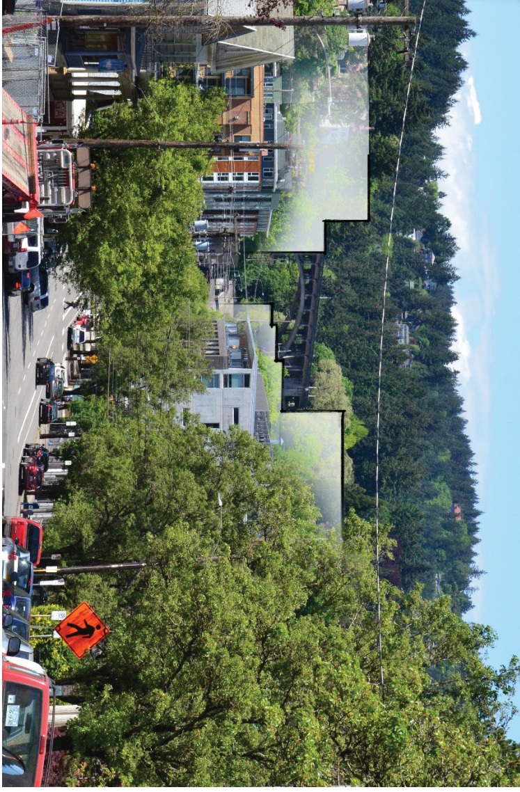
Figure 4: View of Vista Bridge from Jefferson St/1405 Overpass based on Proposed Draft 510-4