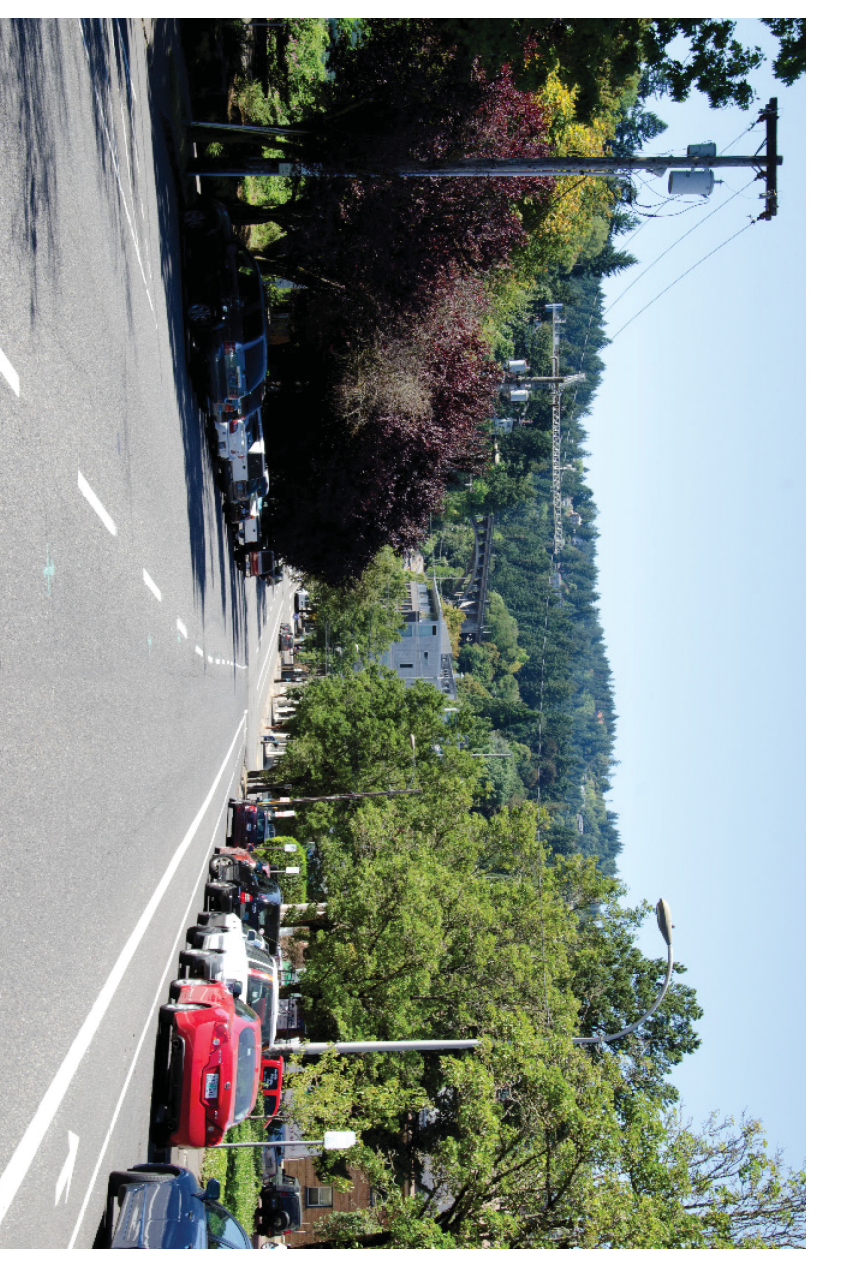
Figure 2. View of Vista Bridge from Jefferson Street

tree canopy on both the north and south sides of the street (see Figure 2). The view is only visible from the the north is partially visible, but development and trees block some of the view. center of the crosswalk; the view from the sidewalks blocked by trees. From the crosswalk, the viaduct to The view of Vista Bridge from the Jefferson St overpass is currently impacted by development and existing