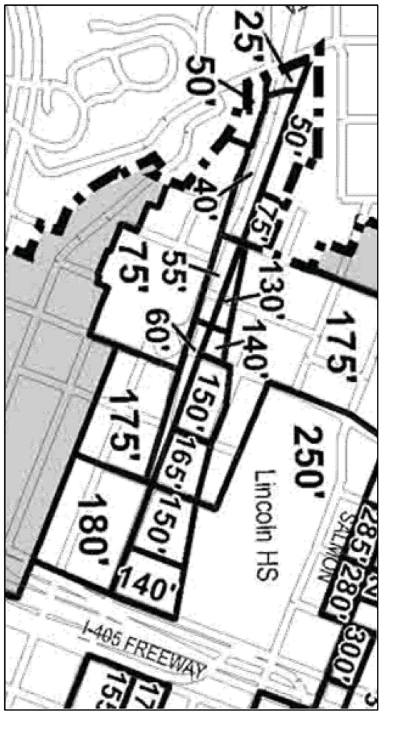
Figure 3. Proposed 510-4 Bonus Heights

additional height on the north side of SW Jefferson St (Figure 3). This increase in height would have a Proposed Draft were based on location and height of those uses. This would allow for roughly 15 feet of historic location. The view is partially blocked by existing buildings and trees. The height limits applied in the negligible impact the view of Vista Bridge from the I405 overpass (Figure 4). The Proposed Draft ESEE decision was to prohibit structures to maintain the view of Vista Bridge from the